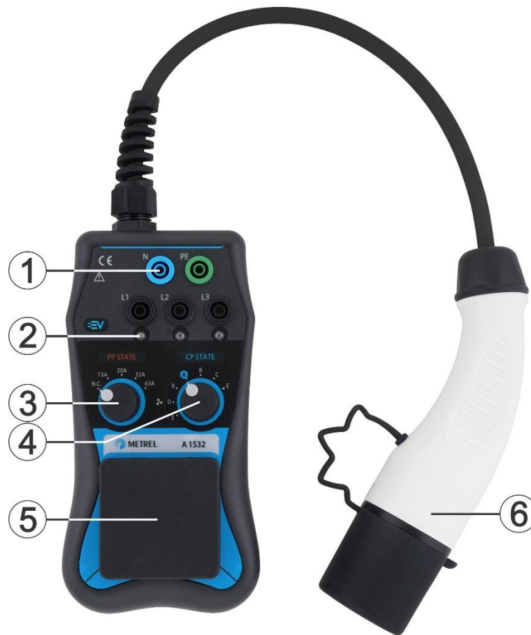
Figure 3.1: A 1532 components